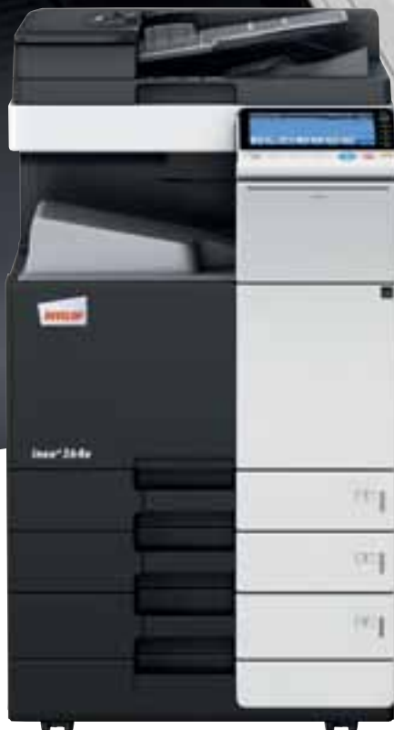
ineo+ 364e with paper feeder (PC-210) and dual scan document feeder (DF-701)