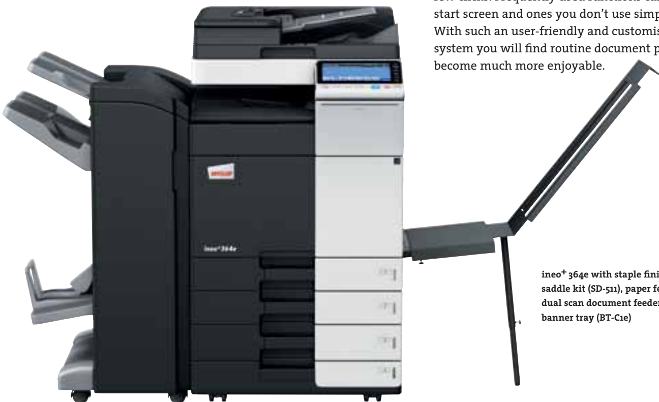
ineo+ 364e with staple finisher (FS-534), saddle kit (SD-511), paper feeder (PC-210), dual scan document feeder (DF-701), banner tray (BT-C1e)

Many multifunctional office systems are anything but user-friendly. The ineo+ 364e, in contrast, is simplicity itself. An intuitive, easily understandable operating concept ensures that it is as easy to use as your smartphone or tablet. The 9-inch capacitive touchscreen comes with familiar multi-touch operations such as flick, drag&drop and pinch in&out – so you will feel at home in this system in no time at all. Thanks to a new menu navigation structure you can see all functions in one go and select the settings you want with just a few clicks. Frequently used functions can be left on the start screen and ones you don't use simply removed. With such an user-friendly and customisable office system you will find routine document production jobs become much more enjoyable.